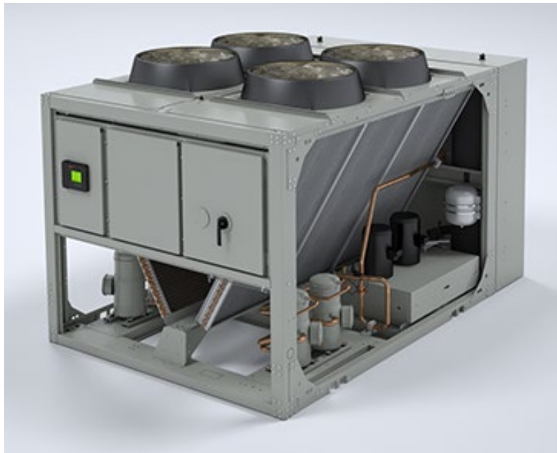
Packaged Roof Top Chiller Unit