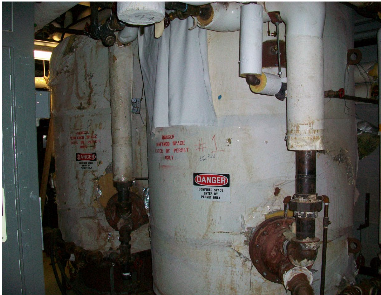
EXISTING STEAM-TO-HOT WATER HEAT EXCHANGER AND STORAGE TANKS