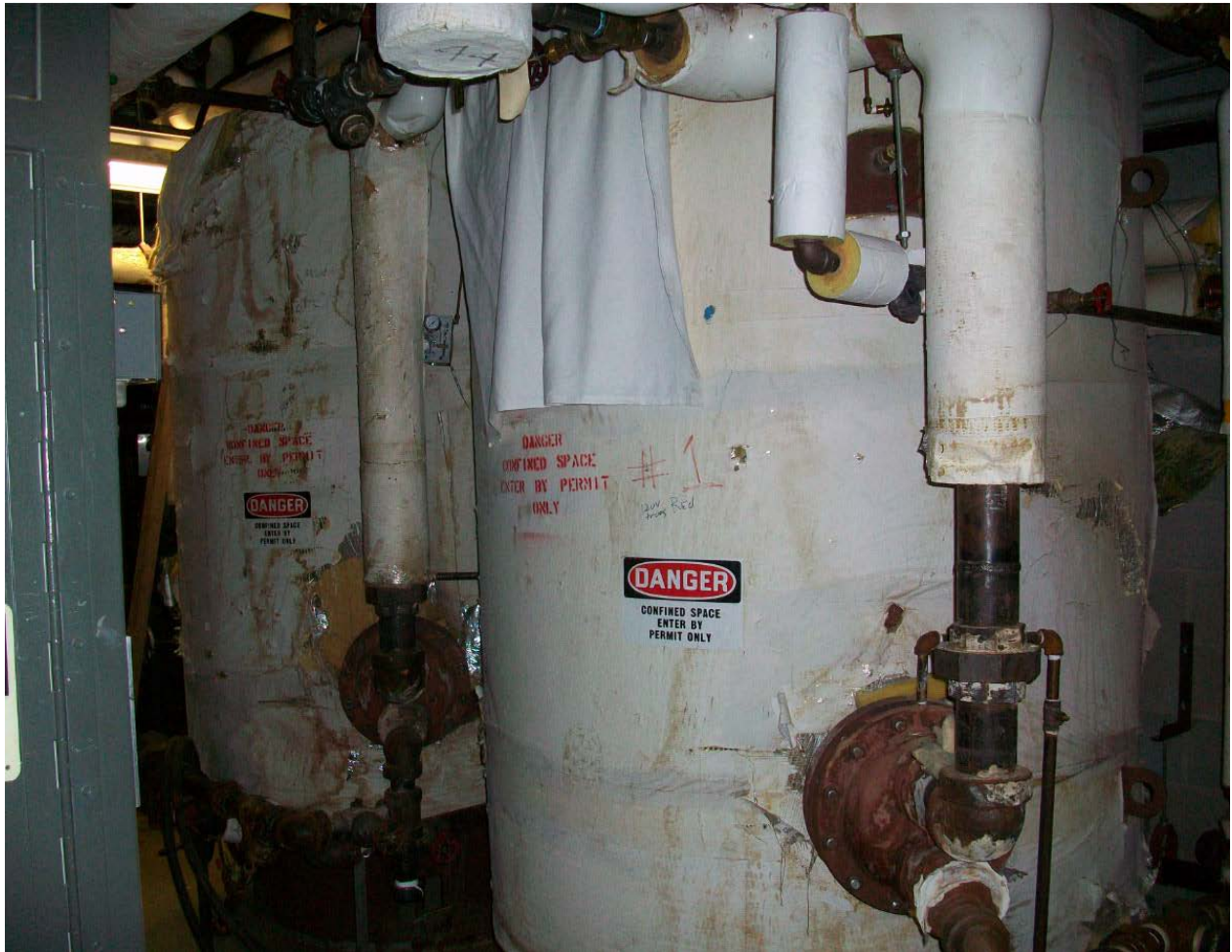
EXISTING STEAM-TO-HOT WATER HEAT EXCHANGER AND STORAGE TANKS