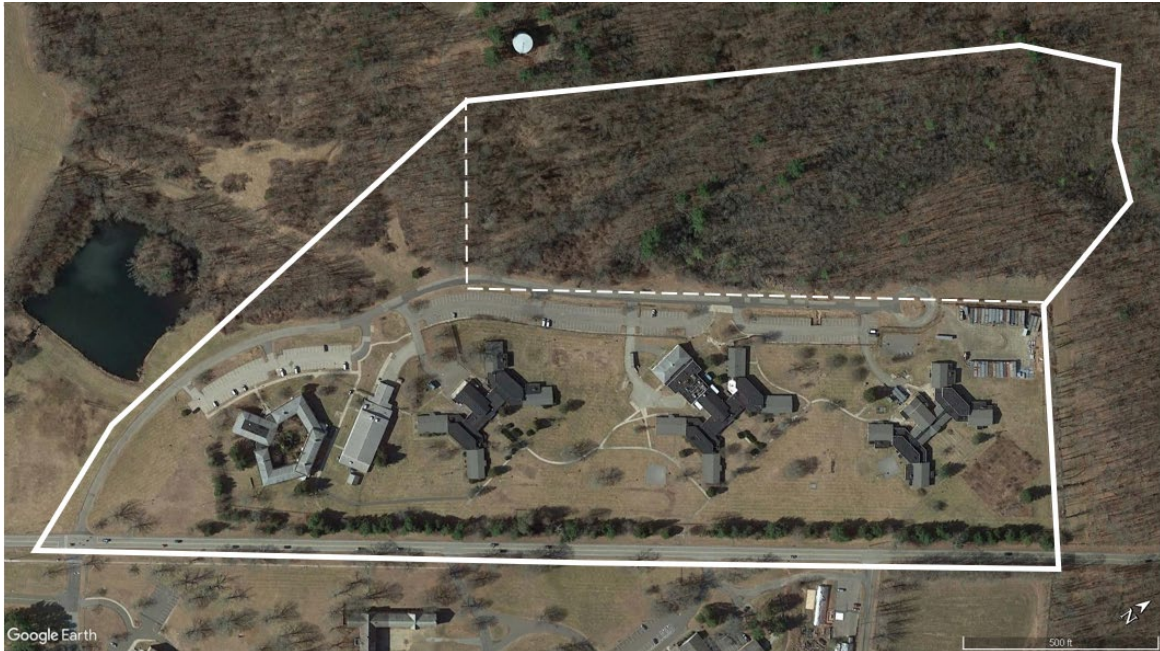
Bergin proper and portion of adjacent conservation area